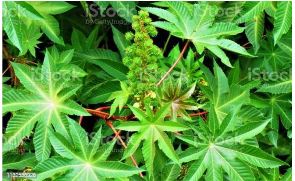
Castor Plant (Ricinus Communis) Thel Enderu https://en.wikipedia.org/wiki/Ricinus

Extraction of Jatropha or Castor oil does not require expensive refineries, just mechanically using rams or screw presses. Such as small scale coconut oil extraction presses readily available and locally made. As such ideally suited for a cottage industry and intercropping of jatropha or castor. Assuming price of LKR 200/liter (half price of Diesel at the moment) that's about LKR 200,000 per year per acre.