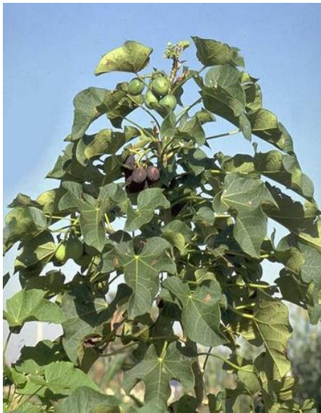
Jatropha Curcas Rata-erandu, Weta erandu (රට එරඳු , වැට එරඳු ) https://en.wikipedia.org/wiki/Jatropha_curcas

So it is imperative there is at least partial self sufficiency in imports including fuel. Maybe bio fuels such as jatropha or castor oil is a partial answer. Jatropha grows on marginal lands, Areas such as in Sri Lanka's North West (Mannar area) and East Coast (Batticaloa) could be used. Average yield of Jatropha is 1892 liters and Castor 1,400 liters of oil per year which very roughly equivalent of one metric ton of Diesel 1 . The highest import of Diesel to Sri Lanka was 2,194 Metric Tons in 2017 2 (1 metric tonne of Diesel is 1176.4 liters). . So, it would appear 2,000 acres of marginal land would make Sri Lanka self sufficient in Diesel. (would appreciate cross check of numbers).